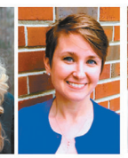
Jessica London 931-581-3988